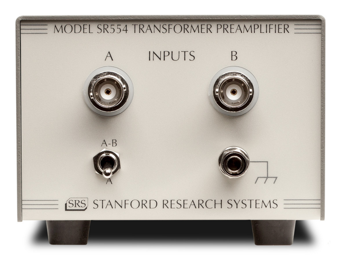
SR554 Front Panel